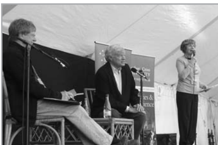
Kerry O'Brien and Geoffery Robertson at the Byron Bay Writers Festival.